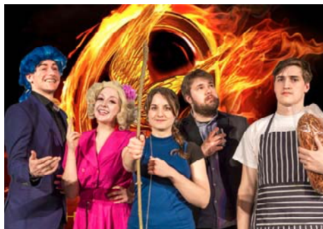
Drama & Music teachers recreate the Hunger Games for WBD

Letters have been sent to parents advising of the new dates for these day trips, which now take place on 23rd & 26th March.